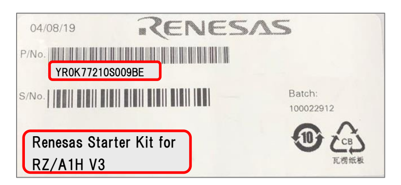
Figure 3 Location of the Product Part Number and Version (Side of an Individual Packing Box for YR0K77210S009BE and YR0K77210S011BE)