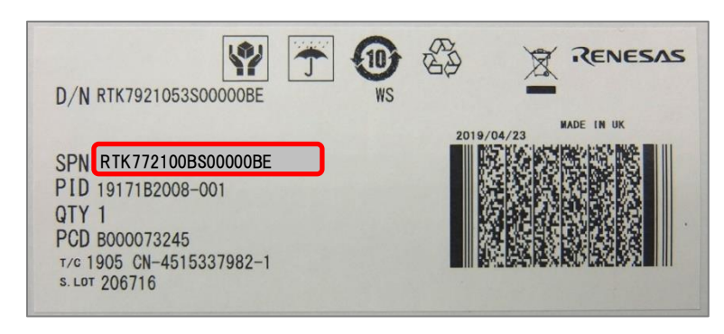
Figure 2 Location of the Product Part Number (Side of an Individual Packing Box for RTK772100BS00000BE)