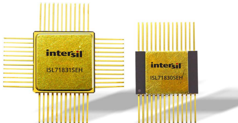
Figure 2. ISL71830SEH 5V 16-channel multiplexer and ISL71831SEH 5V 32-channel multiplexer

The next solution, which is often the most cost-effective, is to purchase low voltage radiation tolerant analog multiplexers as they are designed from the ground up with high reliability in mind. A couple examples include the ISL71830SEH 5V 16-channel multiplexer and the ISL71831SEH 5V 32-channel multiplexer, as shown in Figure 2. These ICs deliver industry-leading performance with low on resistance (120Ω max), low switch input leakage (120nA max), fast address transition times (50ns typ) and SEB resistant to a LET of 60MeV • cm 2 /mg. Both multiplexers provide cold spare redundancy capability, allowing the connection of 2-3 additional unpowered multiplexers to a common data input line. This is an especially important feature for mission-critical space flights lasting up to 20 years.