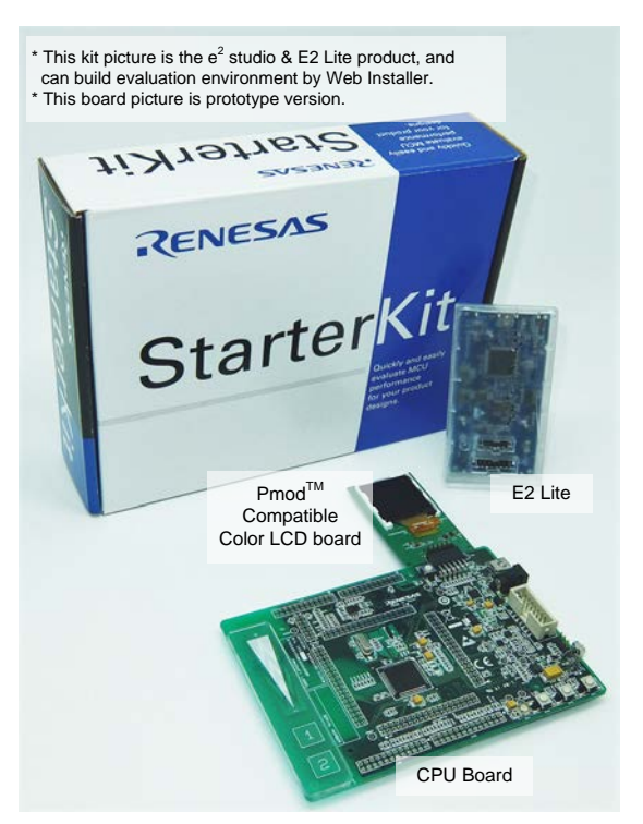
Figure 1 e<sup>2</sup> studio Edition (A dedicated installer disk comes with the CS+ Edition.)

The kit includes all the following hardware and software necessary for development, for immediate evaluation of the RX130.