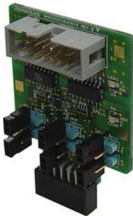
Isolator for the E1 Emulator R0E000010ACB10

The isolator for the E1 emulator is used for debugging environments in which there is a potential difference between the user system GND and the host PC GND. You can choose one of two product types, according to the MCU in use. For details, refer to section 2.