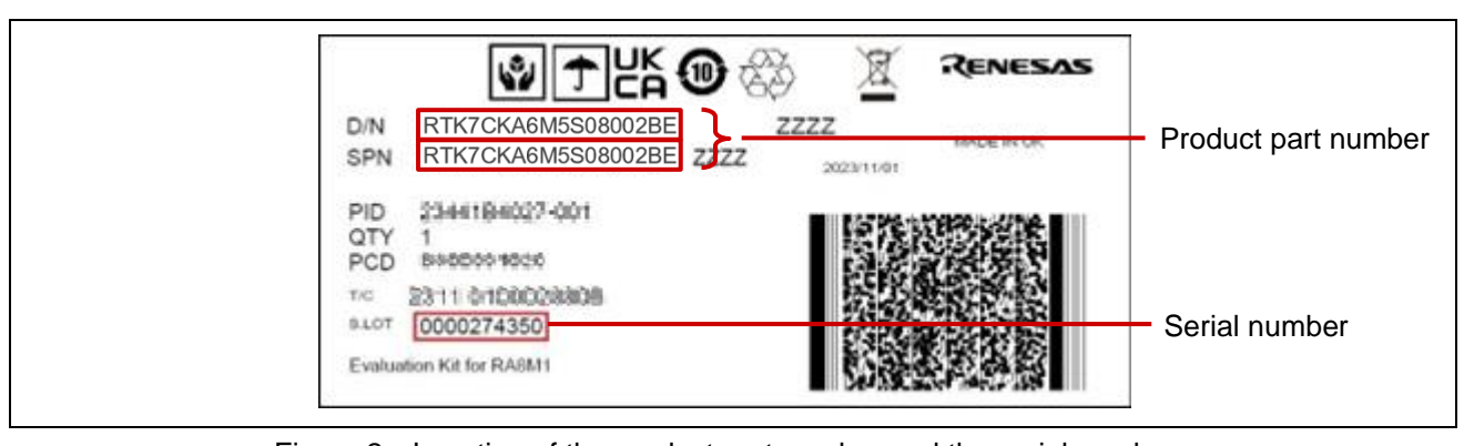
Location of the product part number and the serial number (Side of the individual packaging box)