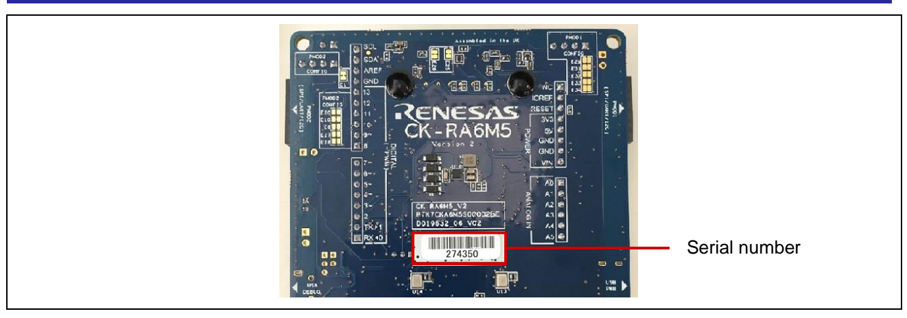
Figure 3 Location of the serial number (Bottom view of the CK-RA6M5 v2 board)