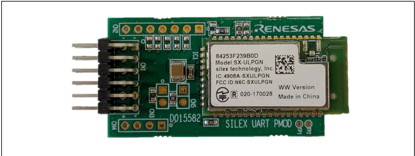
Figure 1. Wi-Fi Pmod™ Expansion Board

This document provides an overview of the Wi-Fi Pmod™ Expansion Board from Renesas that uses the SX-ULPGN Ultra-Low Power Wi-Fi module.