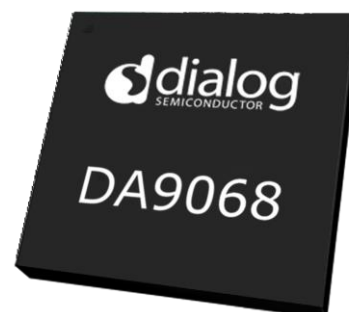
Available in WLCSP, 4 mm x 6 mm, 0.4 mm pitch

Dynamic voltage control (DVC) allows supply voltages of DA9068 to be controlled dynamically according to the operating point of the system. The control can be realized via direct register writes through the I 2 C interface or via GPIOs.