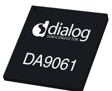
Available in QFN40, 6 mm x 6 mm, 0.5 mm pitch package consumer and automotive grades

DA9061 is also available as an automotive AEC-Q100 Grade 3 version.