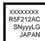
Fig. 3 R5F212ACSNXXXLG