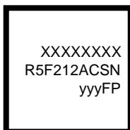
Fig. 1 R5F212ACSNXXXFP