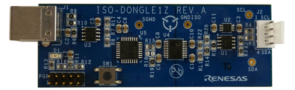
Figure 1. ISO-DONGLE1Z Board

The user's manual for all Renesas BMS GUIs provides additional information on the steps required to use the dongle to communicate between a target GUI and evaluation kit. Most evaluation boards should be powered before the dongle is connected.