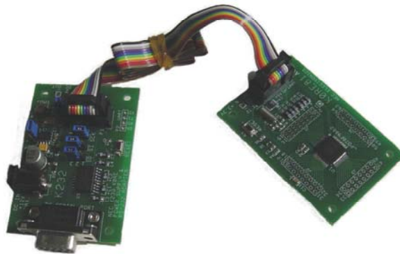
Figure 3. Ribbon Cable Connection

The second is with an extension ribbon cable supplied with the K232 that plugs onto the P1 10-pin header on the circuit side of the K232. The other side plugs into the flash programmer header on the K0RE81. These connections use keyed headers and can only be plugged in one way. See Figure 3.