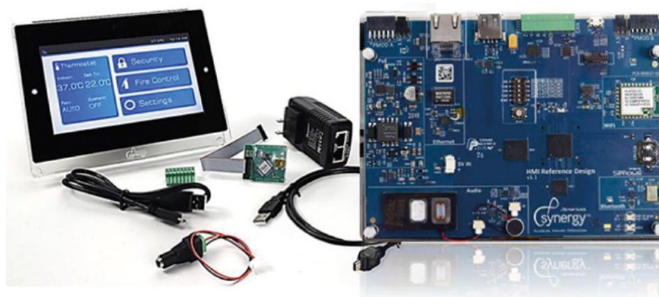
Figure 12-2: The PE-HMI1 provides everything needed to develop a feature rich HMI application

Right now, a couple of PEs are available / planned. One of the examples is the PE-HMI1, a development board for evaluating the Synergy S7G2 Group Microcontroller (MCU) in a Human-Machine Interface (HMI) application. With its TFT LCD display and communication features like Wi-Fi 802.11a/b/g, BLE, Ethernet, USB and CAN, it closely matches the functionality and appearance of a real HMI end-product, allowing a rapid development of such products. Components included are an integrated 7-inch wide-format WVGA (800 x 480 pixels) display with a capacitive touch screen overlay, a J-Link® Lite ARM® debug probe, a universal Power over Ethernet (PoE) power injector and the necessary cabling and documentation.