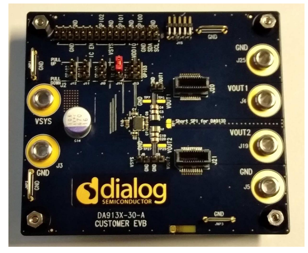
Figure 1: DA913x-30 Evaluation Board

The DA913x-30-A Customer Evaluation board referred below as "EVB" enables the measurement and evaluation of the DA9130/DA9131/DA9132 PMIC.