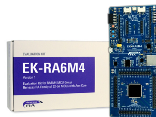
Evaluation Kit: EK-RA6M4