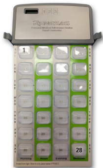
Smart Connector with Printed Foil Blister Pack

The Smart Sleeve model was designed for elegance and compatibility with off-the-shelf blister packs. The user interface and setup is still simple and intuitive - the blister pack slides into the smart sleeve and the device is ready to be powered up.