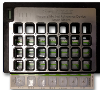
Smart Sleeve with Blister Pack

Personal Medication Adherence (PMA), or lack of PMA compliance, is a $337 billion problem annually in the U.S. that bogs down our healthcare system (1) . Patients forget to take or may confuse their medication, which can result in being readmitted to the hospital, a skilled nursing home or assisted-living facility, or with another visit to the doctor's office. Recent healthcare laws are emphasizing value-based healthcare and use of technology to improve quality of service. The advent of the Internet of Things (IoT) has brought various technologies to the forefront that, when applied to PMA devices, can help resolve some of the issues we currently face.