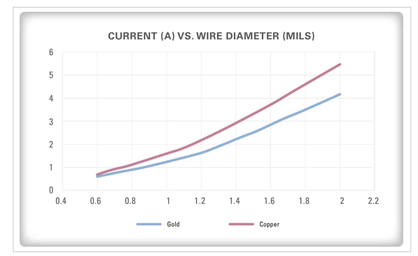
Figure 2: Current-carrying capability of 1-mm-long gold wire using FEM and the Preece equations

Figure 3: Current-carrying capability of 1-mm-long gold and copper wires using the FEM approach