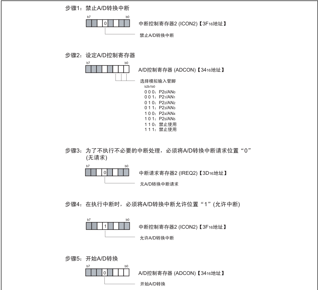
图 1 A/D 转换器的设定方法