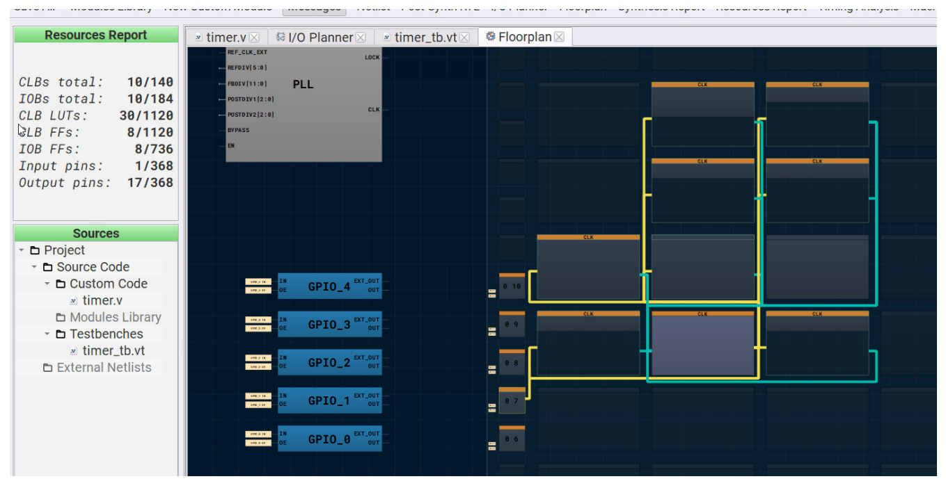
Figure 3: Countdown Timer CLB Utilization

The Floor planner tab in the FPGA Editor shows the placement of CLBs and FFs (Figure 3). The resource utilization is shown in the top left corner.