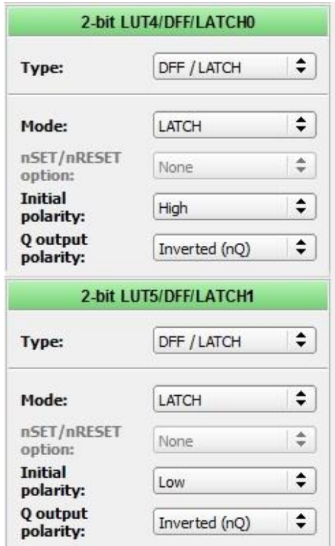
Figure 3. Latches configuration