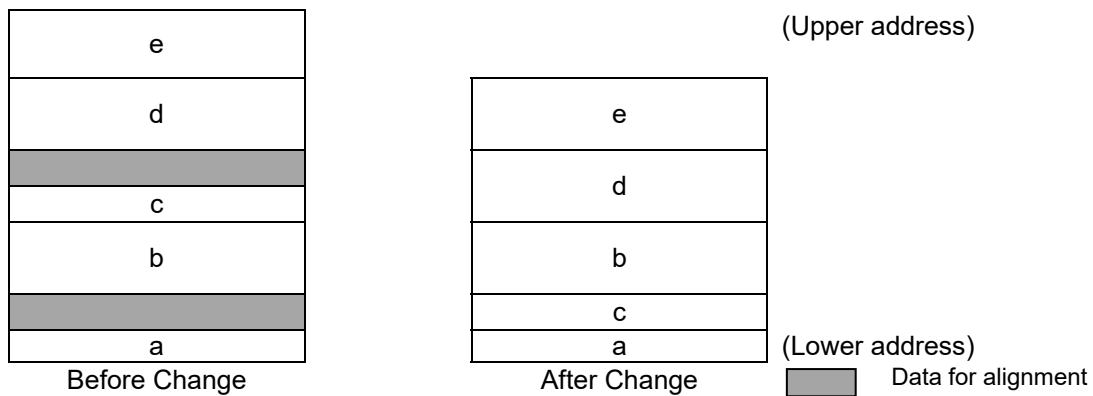
Figure 1.10 Data Allocation in Memory