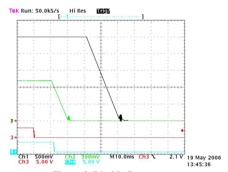
Figure 3. Disable Sequence