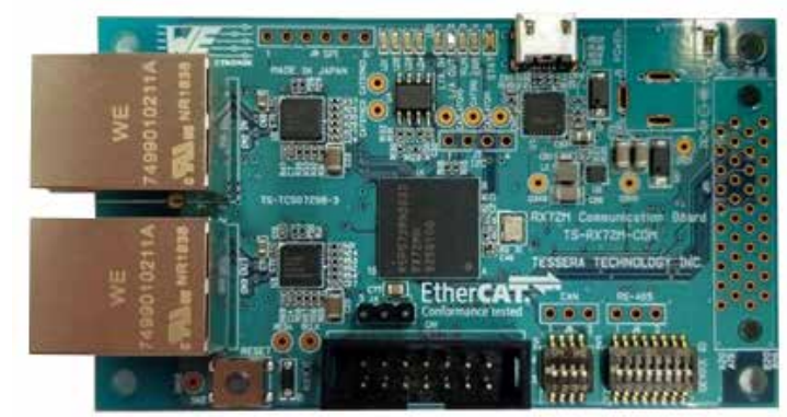
TESSERA TECHNOLOGY INC.

Affordable Evaluation Board for Industrial Networks: "TS-RX72M-COM" by TESSERA TECHNOLOGY INC.