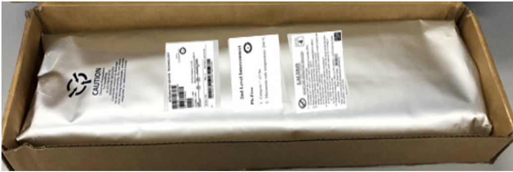
Existing Label Pasting