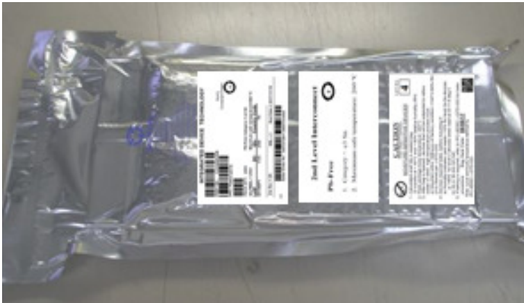
Existing Label Pasting