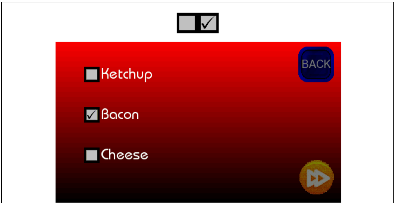
Figure 1 Checkbox.BMP and ScreenMenu

Figure 1 shows the bitmap that we will be used as a check box in the sample code: