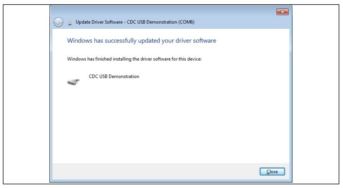
Figure 7-4 Installation Complete

(5). When the following window appears, the CDC driver has been successfully installed. Click "Close."