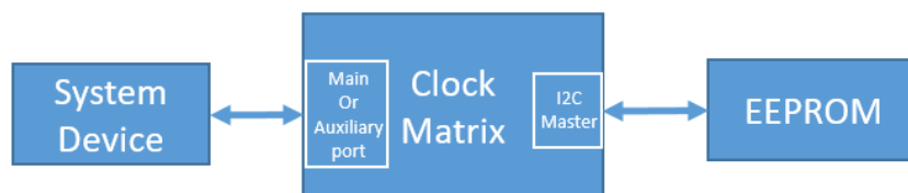
Figure 3. Programming the EEPROM through Clock Matrix

For this option, the ClockMatrix chip serves as the intermediary, transferring the data from the System Device to the EEPROM, as shown in Figure 3 . Either a CPU, an FPGA, or a different System device will “talk” to the ClockMatrix device through the Main or Auxiliary Serial port and send it the firmware data. In turn, the ClockMatrix device will send the data to the EEPROM chip. Note that it is the customer's responsibility to parse the .hex file into a format that is usable by their system.