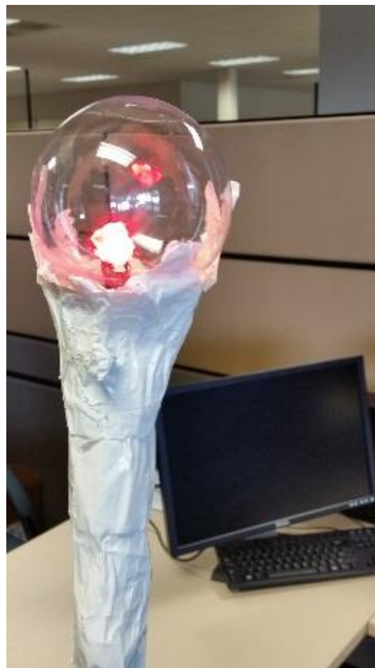
Figure 1. Gandalf's Staff

For Gandalf's staff an RGB LED has been used to allow the color to have 4 possible variations: red, blue, green, and white. Each of the four LEDs that are used were attached to three separate pins at their cathodes and were tied to the V_{DD} at their common anodes. A simple state machine, made with D flip-flops and lookup tables is designed to cycle between the four colors. The A' LUT configuration truth table is shown in Fig. 2. The state machine is clocked by an analog comparator tied to the z axis of the accelerometer. Since there were problems being faced with the state machine cycling through multiple colors (rather than one at a time), the output of the analog comparator was de-bounced with a rising edge detector (P DLY0) and a 96.064 MS delay (CNT3/DLY3) before it went to the CLK of the D flip-flops. Refer to Fig. 3 for a view of the circuit in GreenPAK Designer.