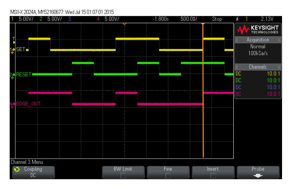
Figure 2. Level Triggered RS Latch Timing Diagram