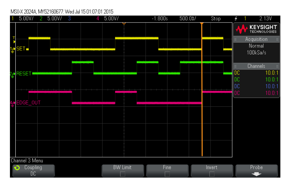
Figure 4. Edge Triggered RS Latch Timing Diagram

For edge and level trigger comparison, figure 5 lines up the two different latches' outputs together.