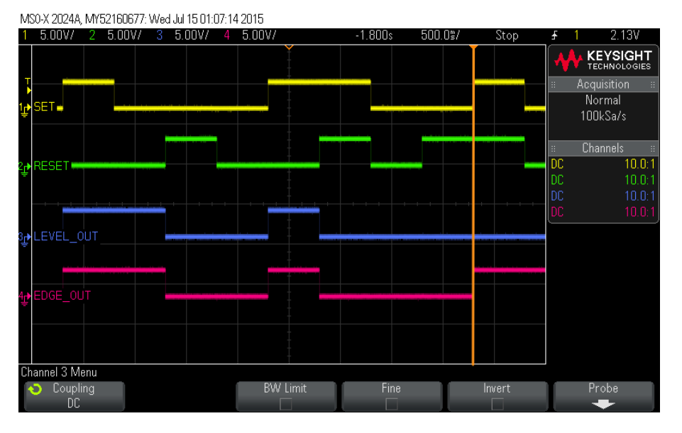
Figure 5. Edge and Level triggered RS latch timing diagram