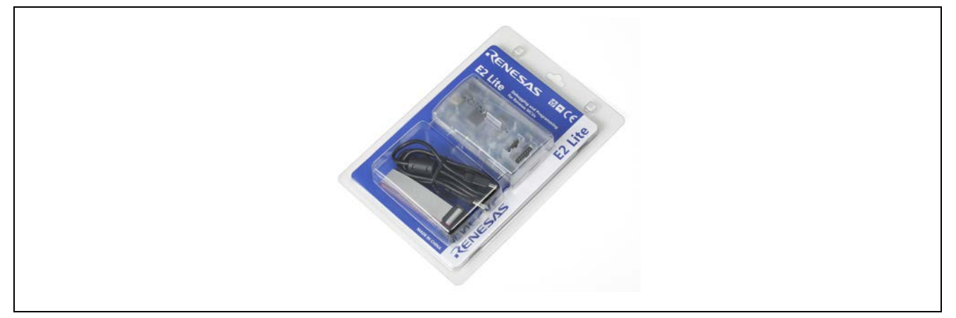
Figure 4 E2 Emulator Lite Product Package