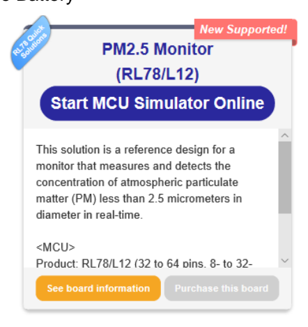
Figure 1 MCU Simulator Online sample project selection panel