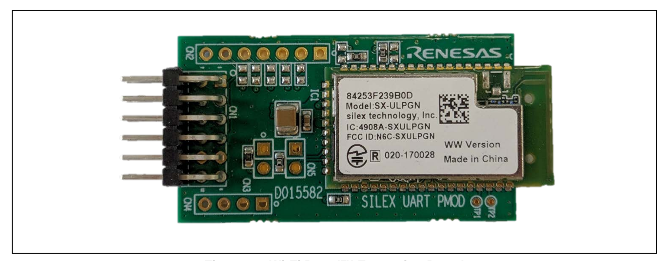
Figure 1. Wi-Fi Pmod™ Expansion Board

This document provides an overview of the Wi-Fi Pmod™ Expansion Board from Renesas that uses the SX-ULPGN Ultra-Low Power Wi-Fi module.