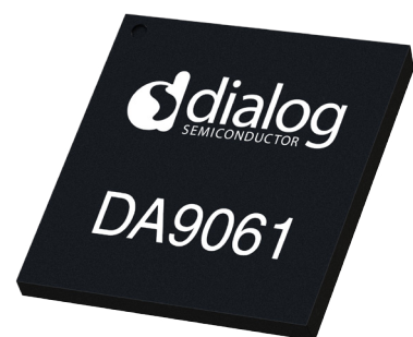
Available in QFN40, 6 mm x 6 mm, 0.5 mm pitch package consumer and automotive grades

DA9061 is also available as an automotive AEC-Q100 Grade 3 version.