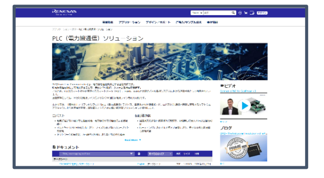
Figure 5. R9A06G061 DC Communication Module (3.8cm x 2.8cm) Documentation Available on the Renesas Website