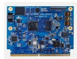
[All-in-One System On Module]