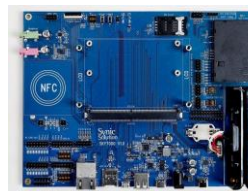
[Development Carrier Board]