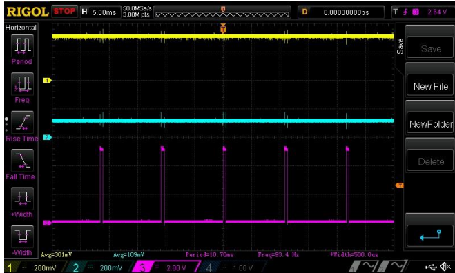
Fig 4. Timing waveforms for servomotor position -90 degrees

Channel 1 (yellow/top line) – PIN#3 (VREF) Channel 2 (light blue/2nd line) – PIN#6 (V_IN) Channel 3 (magenta /3rd line) – PIN#9 (OUT)