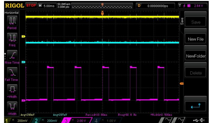
Fig 5. Timing waveforms for servomotor position 90 degrees

Channel 1 (yellow/top line) – PIN#3 (VREF) Channel 2 (light blue/2nd line) – PIN#6 (V_IN) Channel 3 (magenta /3rd line) – PIN#9 (OUT)