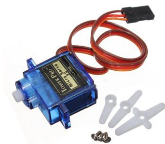
Fig. 1. TowerPro SG90 - Micro Servo

This example shows the design of a servomotor controller. The specific servo used in this design is the TowerPro SG90 - Micro Servo, as shown in Fig.1.