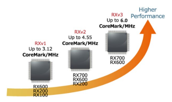
Figure 1-2 Comparison of RXv1 Core, RXv2 Core, and RXv3 Core

Measured in combination with RXv3, the CC-RX V3 has achieved industry-leading performance of 6.0 CoreMark/MHz.