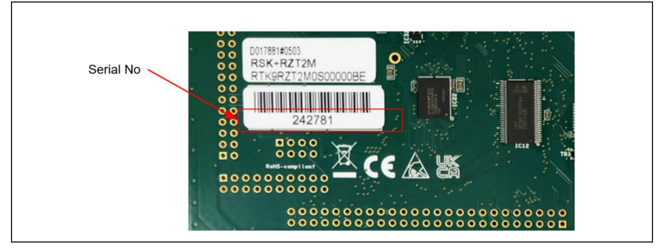
Figure 1: Serial No. location (CPU board solder side)

Product name: Renesas Starter Kit+ for RZ/T2M Part number: RTK9RZT2M0S0000BE Serial number: 240493~240592