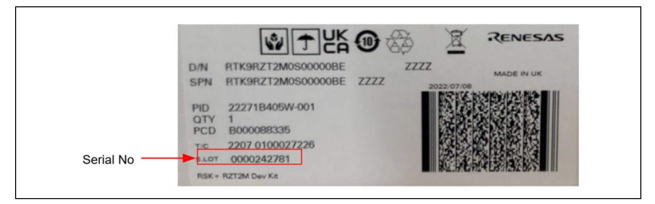
Figure 2: Serial No. location (side of the product box)