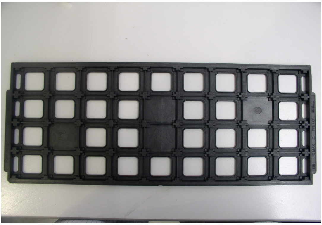
New Shipping Tray