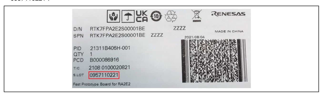
Figure 3. Identification of the Serial Number on the FPB-RA2E2 Kit Packaging

The serial number is located on the packaging label identified as S.LOT and on the serial number sticker on the back/bottom side of FPB-RA2E2 board. In the example in Figure 3 and Figure 4, the serial number is "0957110221".