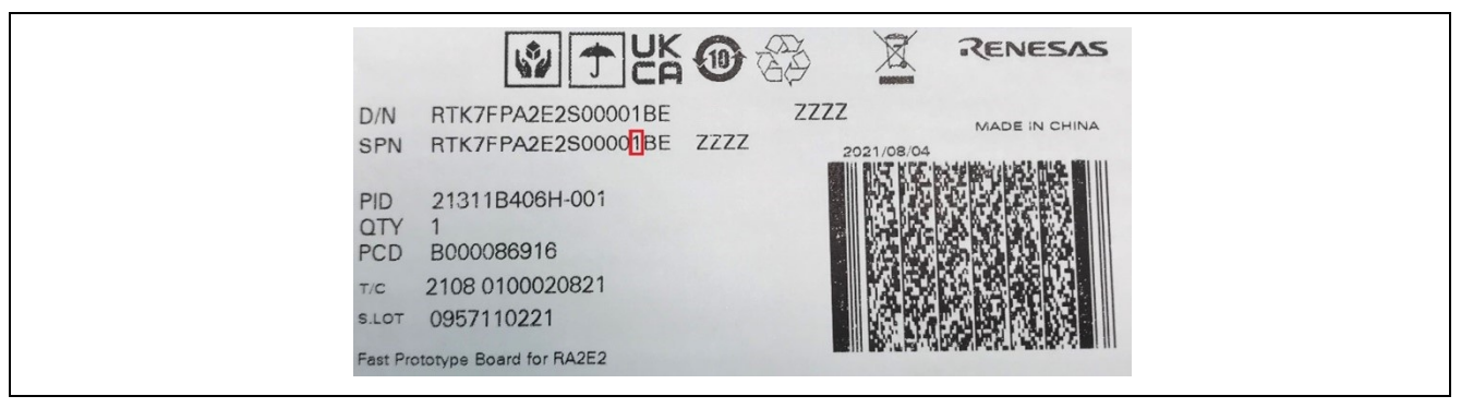
Figure 2. Identification of the Kit Version Number on the FPB-RA2E2 Kit Packaging

The kit version can be found on the FPB-RA2E2 kit packaging label as described in this section. The kit version is the last digit in the orderable part number as shown in Figure 2. In the following example the kit version number is "1".