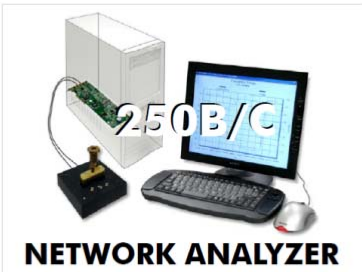
Figure 1. 250B/C Network Analyzer

A simple analysis in sweeping the drive level can be performed to verify changes in both resistance and frequency of the crystal. This analysis, typically called Drive Level Dependence (DLD), can be taken using a Saunders & Associates (S&A) 250B/C desktop network analyzer. Refer to figure 1. S&A manufacturers test and production systems for quartz crystals, oscillators, filters, and components. It has become an industry standard and preferred test system by many of the leading crystal manufactures. This desktop system is relatively inexpensive and is essential if designing or using silicon component, which require quartz crystals.