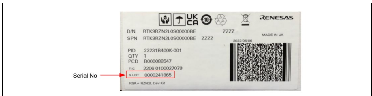
Figure 2: Serial No. location (side of the product box)