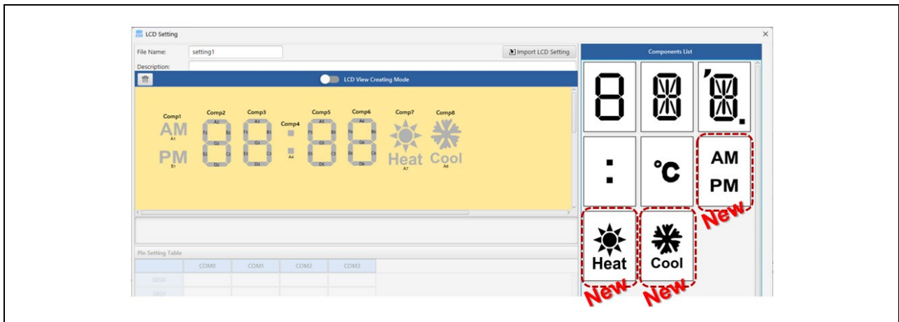
Figure 2 [LCD Setting View] Components List : new components

Add 3 new components shown below to component list in LCD Setting View.