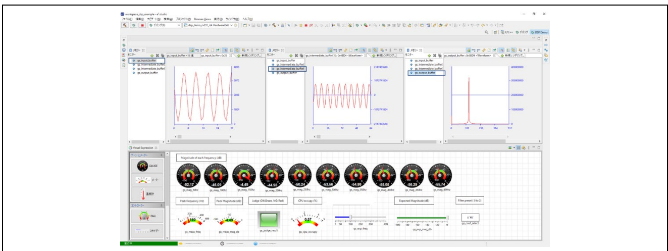
Figure 1 Console of e 2 studio

The sample program runs on the Renesas Starter Kit for RX231 (RSK) or the Target Board for RX231 (Target Board). Note that LCD display processing is supported only by RSK. See Figure 2 and 3.