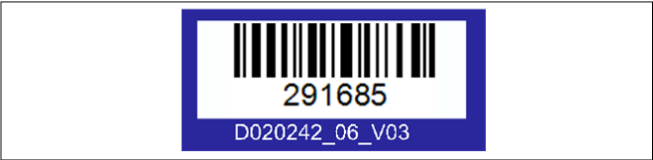
Figure 1. Identification of the Serial Number on the EK-RA4L1 Board