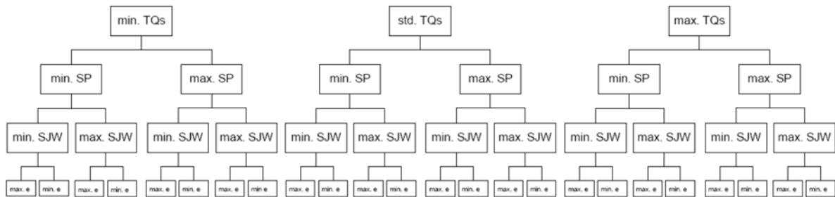
Figure 2: Bit Timing Test Cases