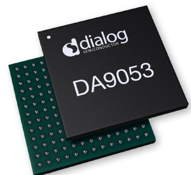
VFPGA 7 mm x 7 mm, 0.5 mm pitch and VFPGA 11 mm x 11 mm, 0.8 mm pitch package, consumer and automotive grade options

An integrated 10-channel general purpose ADC includes support for a touch screen controller with pen down detect, programmable high/low thresholds, an integrated current source for resistive measurements, and system voltage monitoring with a programmable low-voltage warning. The ADC has 8-bit resolution in auto-mode and 10-bit resolution in manual conversion mode.