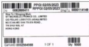
Barcode coding: EAN-128

For additional information regarding this notice, please contact Idt-pcn@lm.renesas.com .