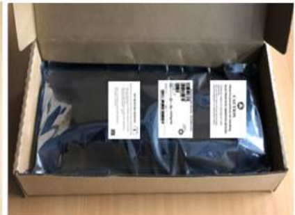
Fig-5c (Paste inner label)