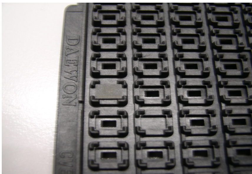
New Shipping Tray