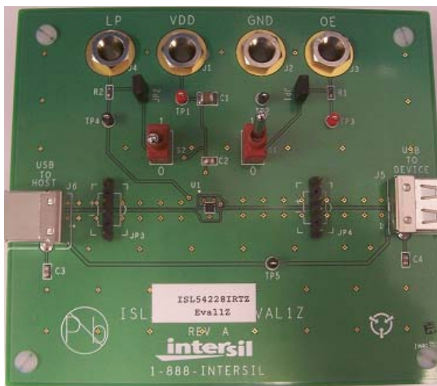
FIGURE 1. ISL54228IRTZEVAL1Z EVALUATION BOARD